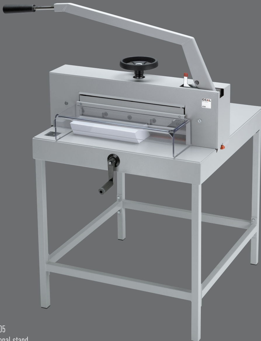
IDEAL 4705 with optional stand