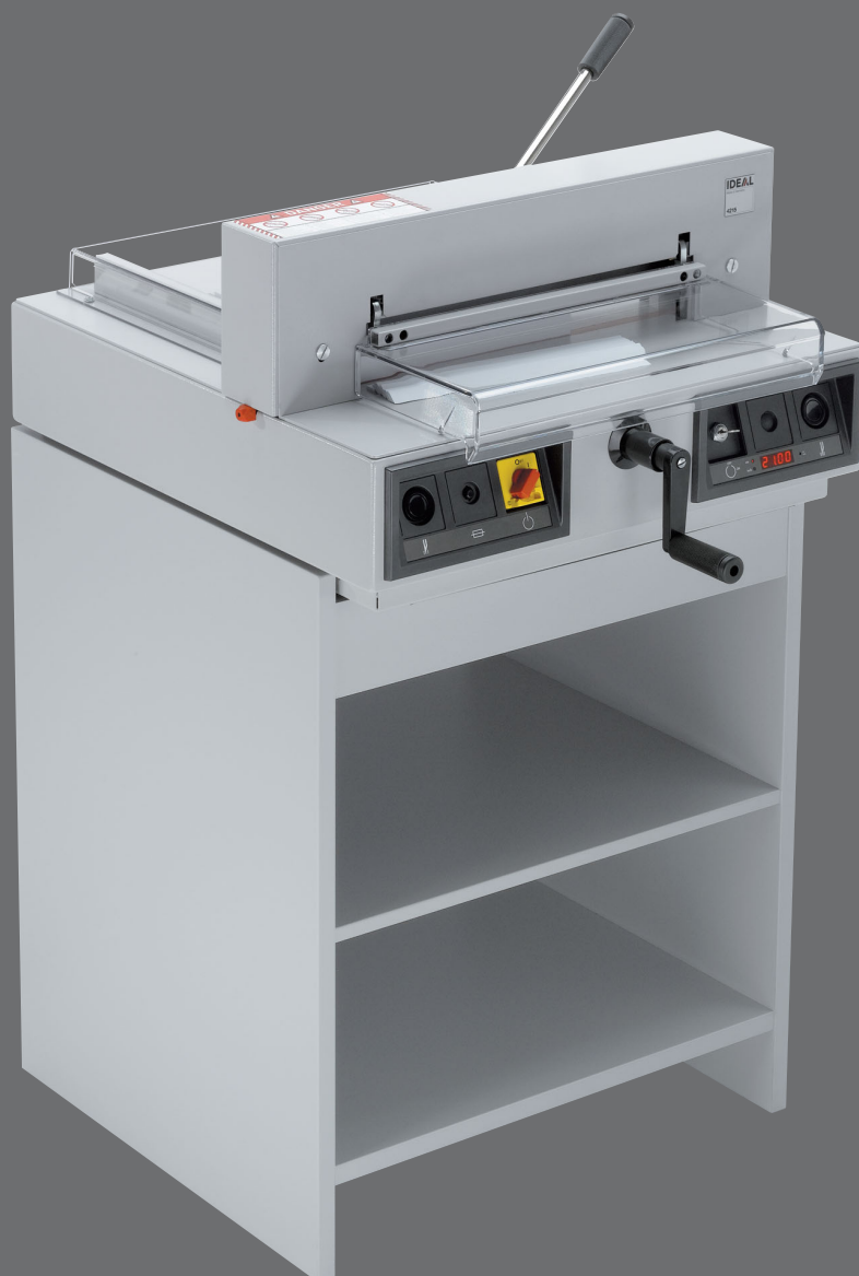
IDEAL 4215 with optional cabinet